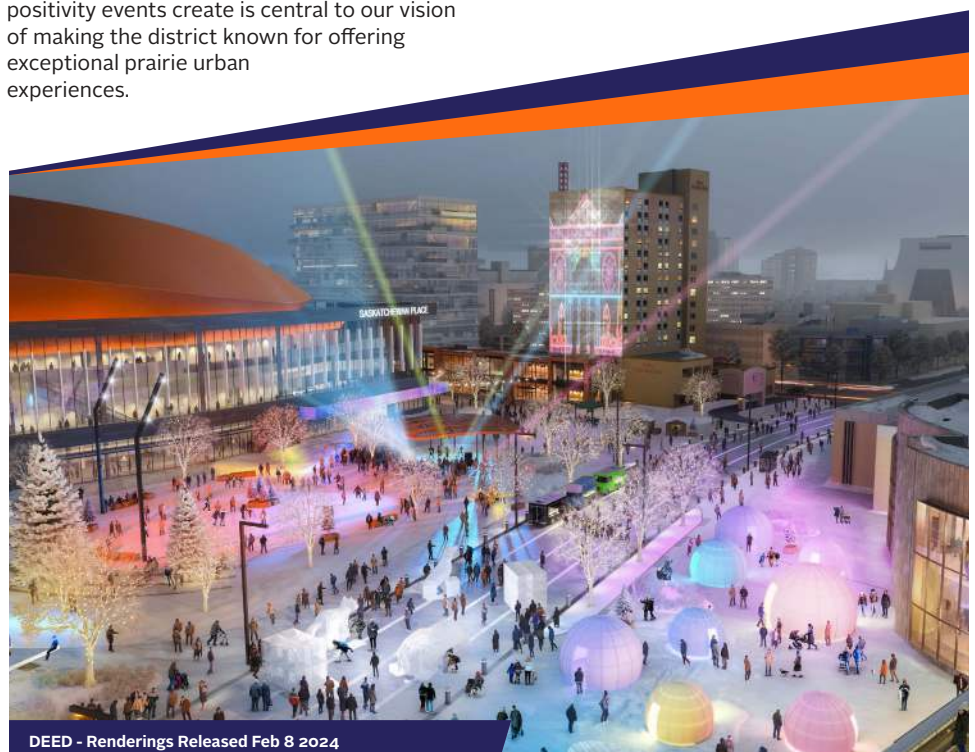
DEED - Renderings Released Feb 8 2024