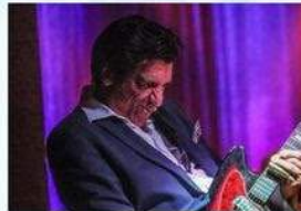
Jimmy And The Sleepers