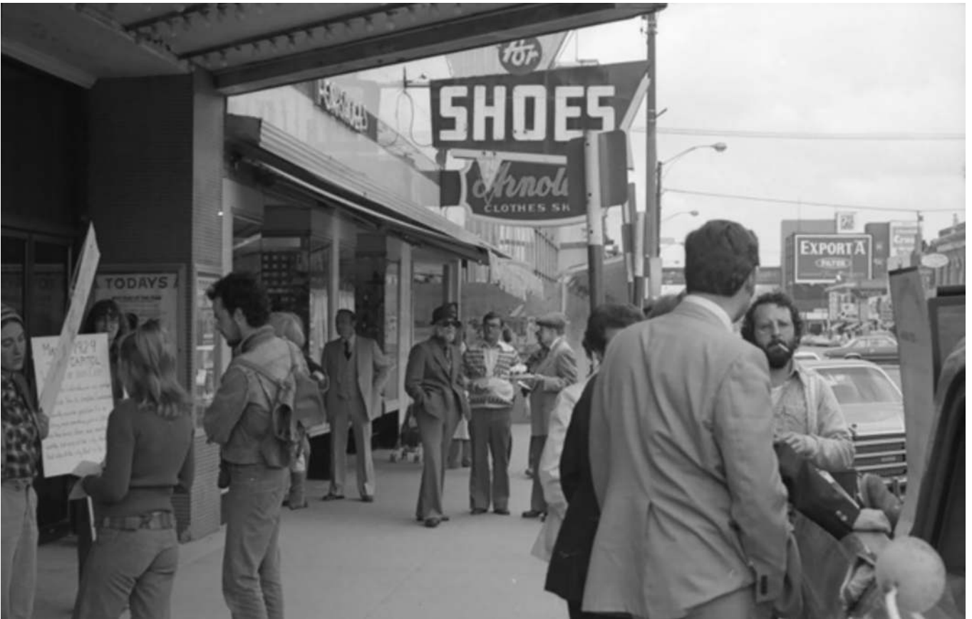
Outside the former Capitol Theatre on 2nd Ave in 1979