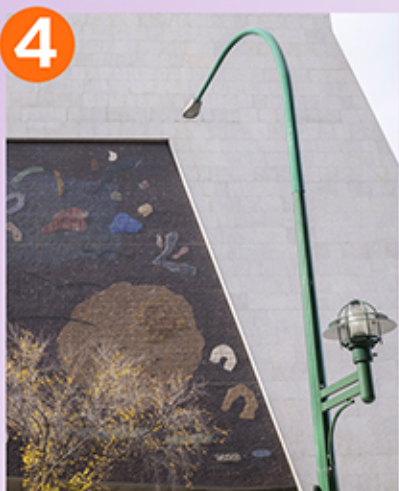
4 The Sturdy Stone building at 124 3rd Ave N features two large-scale mosaics on both 3rd and 4th Ave facing sides.