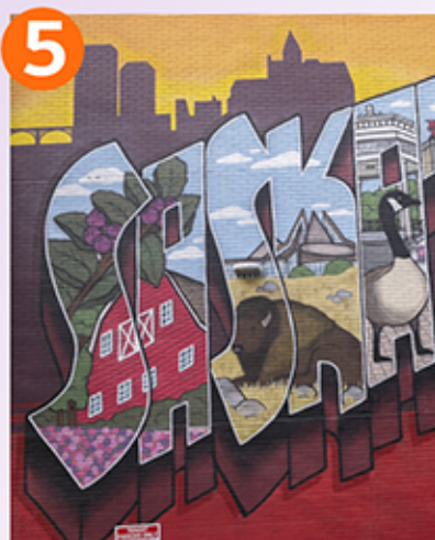
5 Saskatoon mural by Kent Ness 402 21st St E