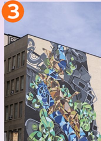
3 The Drinkle Building features art on all exterior sides. Located at 115 3rd Ave S. International and local artists.