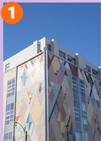
1 Hudson Bay building Mosaics, 203 2nd Ave N.