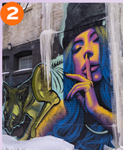
2 The alleyway of 122 2nd Ave N includes multiple mural pieces by a variety of graffiti artists.