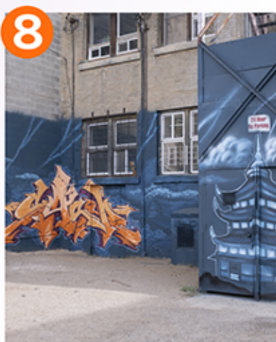
8 Various graffiti pieces in the alleyway between 20th + 21st behind 2nd and 3rd Ave S.