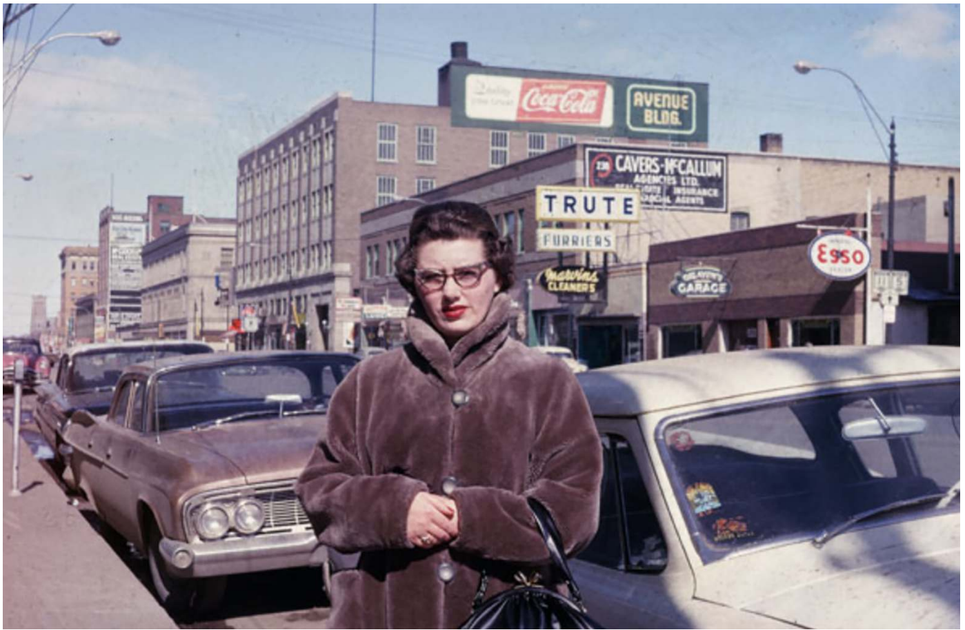
1962 200 block of 3rd Avenue South