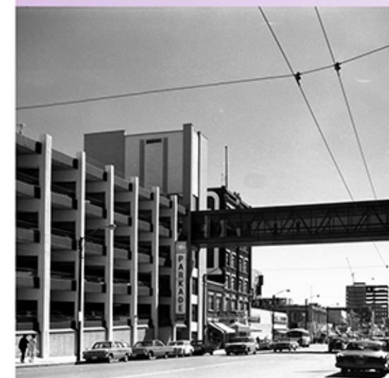
2004 - May 2, Demolition of the Hudson's Bay Parkade on 2nd Avenue and 24th Street began with the removal of the overhead pedestrian tunnel connecting the parkade to the Bay building across the street.