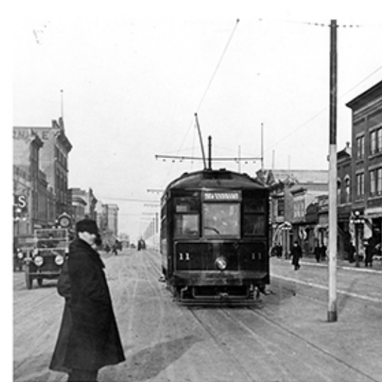
1951 - Nov 10, the last streetcar made its final run.