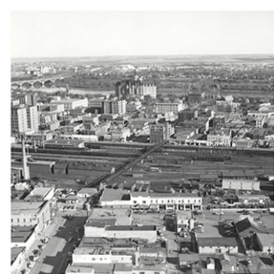
1910 - The 20th Street footbridge was built over the CN's Downtown rail yards to provide a pedestrian link between Downtown and Riversdale. In 1963 - the City of Saskatoon and CNR signed an agreement for the removal of Downtown rail facilities.