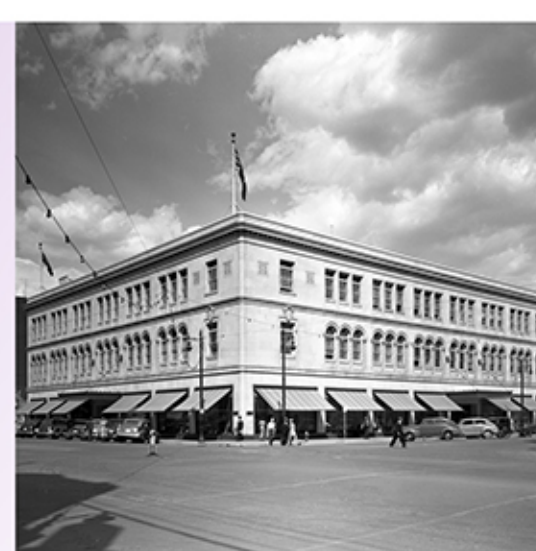
1928 Dec 4, the Eaton's store at 21st St. and 3rd Ave opened.