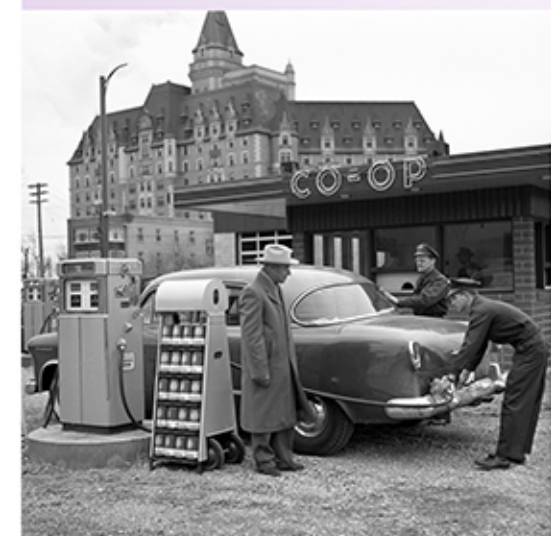
1933 Dec 10, the Bessborough Hotel Opened Named for the Earl of Bessborough, Canada's Governor General at the time of construction.