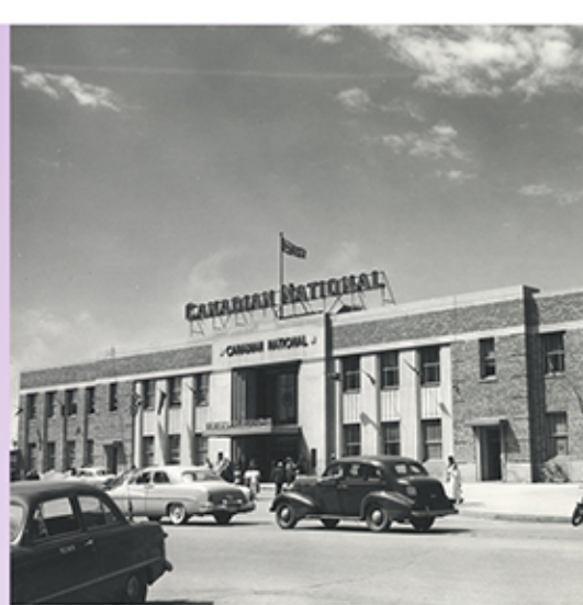
1970 - July 30, Midtown Plaza officially opened on the site of the old CNR station at 1st Avenue and 21st Street.