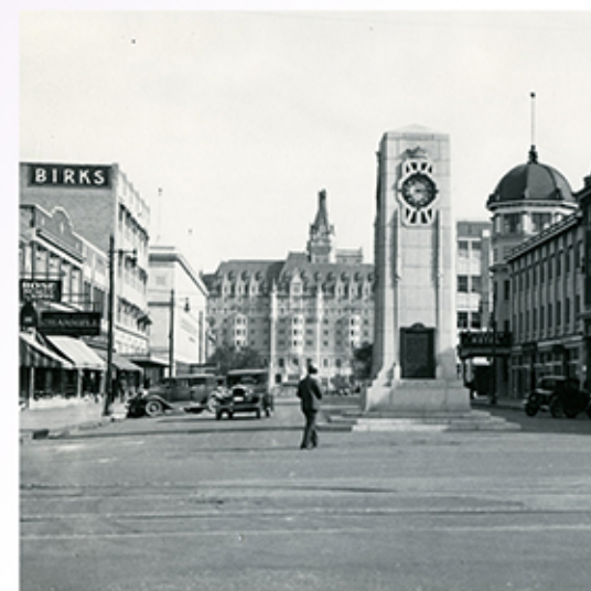
The Cenotaph was built in 1929 and was located at 21st Street near 2nd Avenue until 1957 when it was moved to City Hall Square.