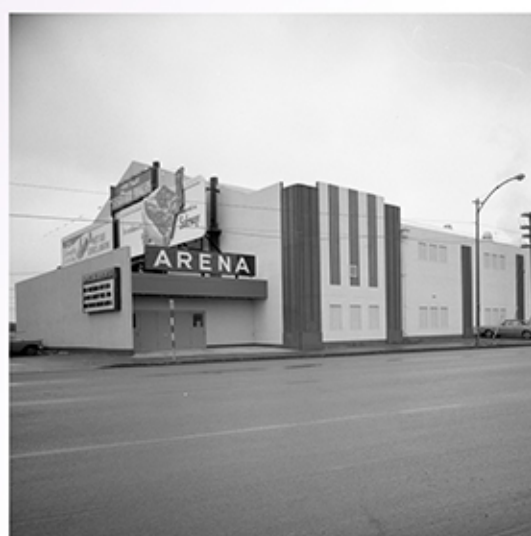
1937 Oct 30, The Saskatoon Arena Rink, AKA The Barn, opened on 19th St and 2nd Ave with a sold-out game between the New York Rangers and the New York Americans.